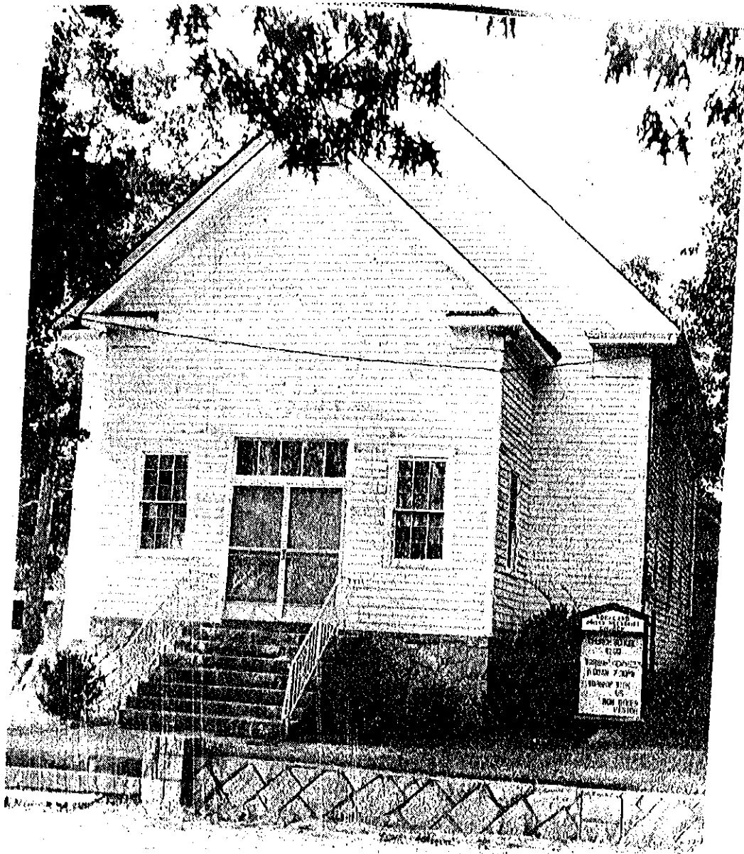
STARTED IN SETTLEMENT OF ARABIA -- This venerable 80-year-old structure will be scene of four-day worship service as members of Rockland United Methodist Church launch annual summer revival with homecoming, Sunday, September 16. Church was organized near brush arbor in 1891. 1973

Subject File: Churches, ROCKLAND UNITED METHODIST CH.