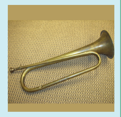
A Confederate bugle labeled, "C.S.A., S.C."