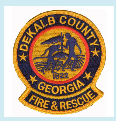
A DeKalb County Fire & Rescue patch, donated in 2013.