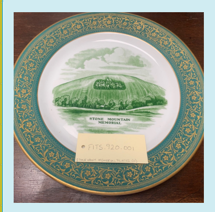
This plate is one of twelve identical plates made exclusively for Hotel Candler.

Here are a few examples of artifacts currently up for adoption: