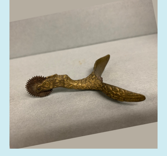
This uncommon artifact is a USA Commercial Officer's Spur from the Civil War. It features an eagle holding the spur wheel with its beak as its wings are extending to hold onto the boot.