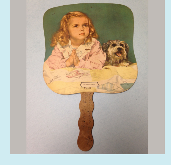
This is a fan featuring a little girl praying with a dog beside her. On the back is an advertisement for "Mann Funeral Home, Home of Thoughtful Service, Conyers, Georgia, Lithonia, GA".