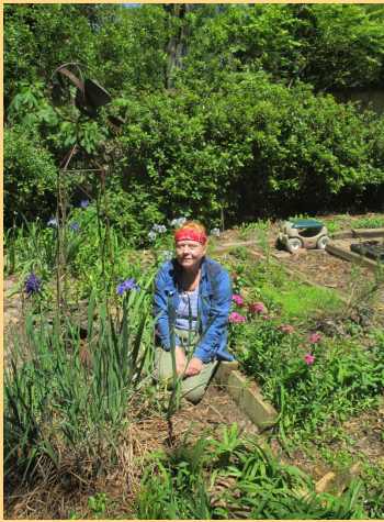
The author in her natural habitat