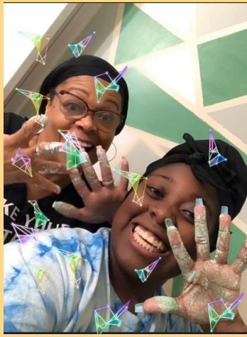
Fun home improvement