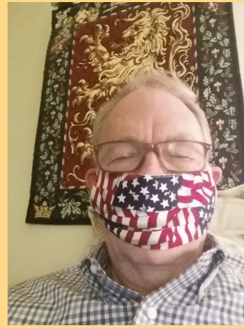
Safety in style

Photos that have already been submitted.