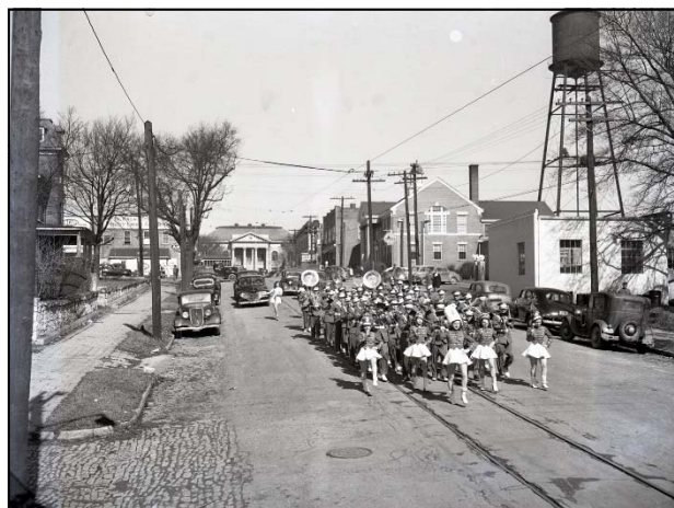
Decatur High School marching band, 1947.