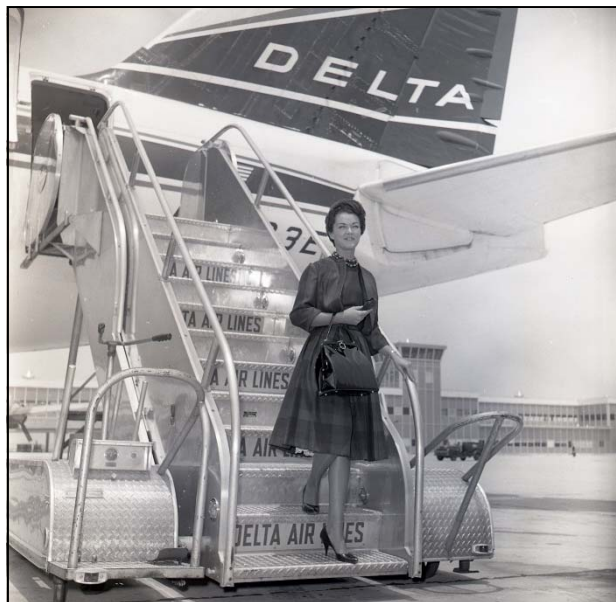
Delta Passenger disembarking in the 1950s.