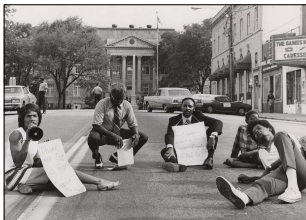
1970s sanitation protest in downtown Decatur.