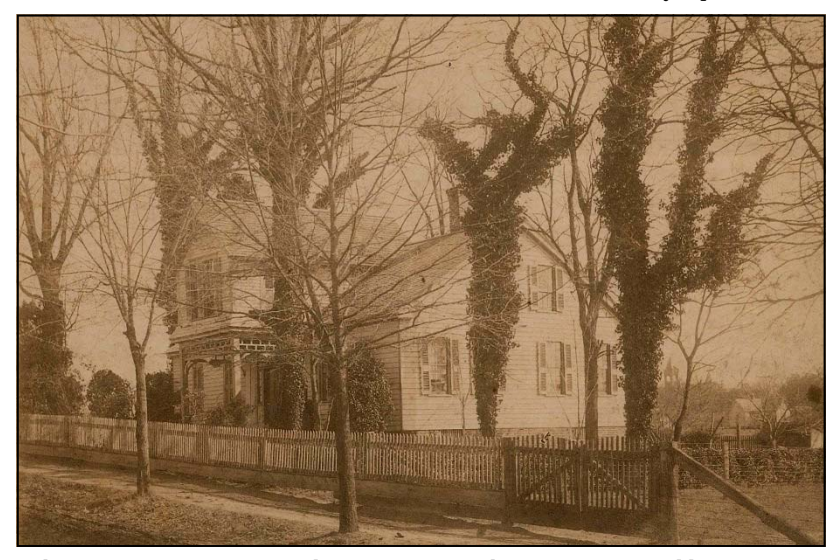
The Swanton House around 1890. It is seen here at its original location in downtown Decatur—240 Atlanta Avenue.

The house was enlarged and updated periodically, each change reflecting the current popular trends. Over the course of about 100 years, the original pioneer cabin was transformed into a Georgian cottage, which is defined by its floor plan of a central hallway with two rooms on either side. Around 1890, the house was embellished with an Eastlake style porch