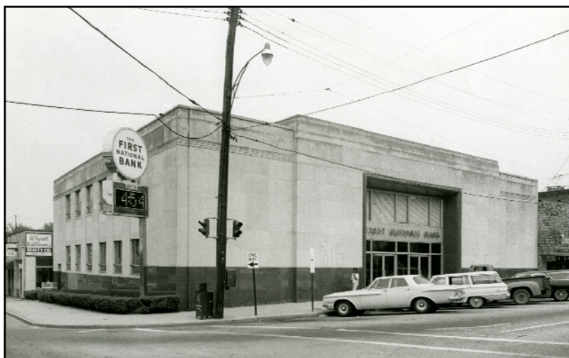
A view of the First National Bank of Decatur from our collection, ca. 1965

"The subject of the panel on the left of the main entrance to the bank is Industry and Agriculture, with a large figure of a worker surrounded by smaller scale ones depicting a welder, a moulder and figures typifying poultry raising, dairying and farming. The other panel is devoted to Learning and Culture, and is dominated by a student in an academic costume, surrounded by five small symbolic figures; on one side Christ stands for Religion, Moses for Law, and Socrates for philosophy, while on the other, Galileo stands as an exponent of Science and Michelangelo of Art...These sculptured panels can now be seen in process of being carved at the main entrance of the new structure."