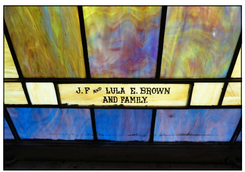
This photo shows of one of the stained glass memorial windows in August 2010.

The third church, a wooden frame structure, was constructed about 100 yards from the recently razed building. It was partially sited on what is