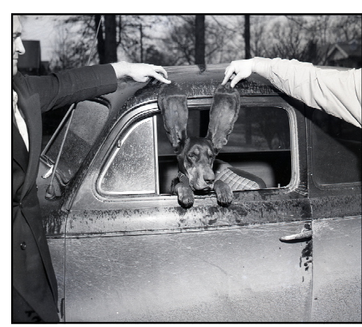
There are many animals featured, including this dog and his amazing ears!