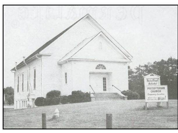
Wesley Chapel as it appeared in 1964—from an article in the DeKalb New Era.

October for the bulldozer to bring down most of the building. We did not know demolition was underway until the bulldozer had nearly finished its task. We hope that a better understanding of historic resources will help prevent these loses in the future. +