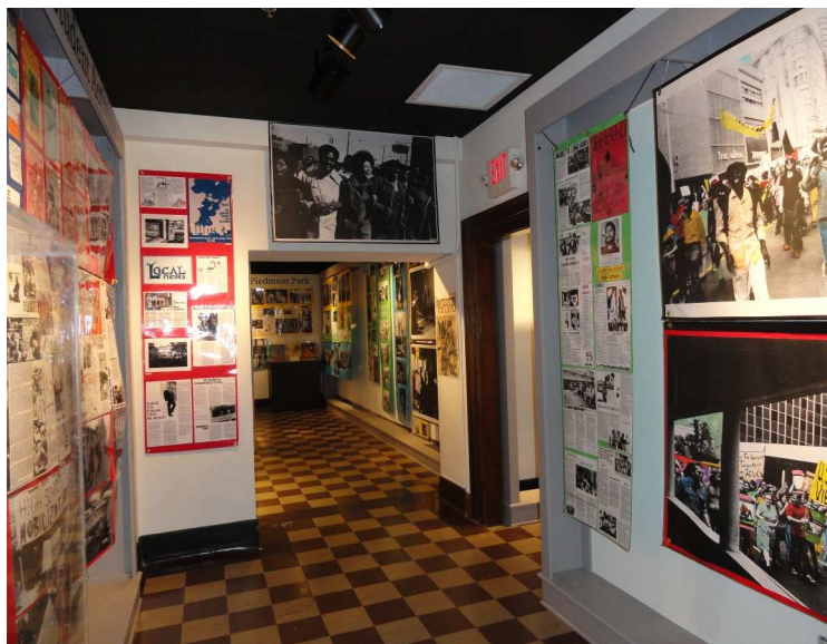
The Great Speckled Bird Exhibit—on view now at the Historic Courthouse. Monday through Friday from 10:00 am to 4:00 pm.

From the first issue, which castigated Atlanta icon Ralph McGill for his support of the war, there was never a