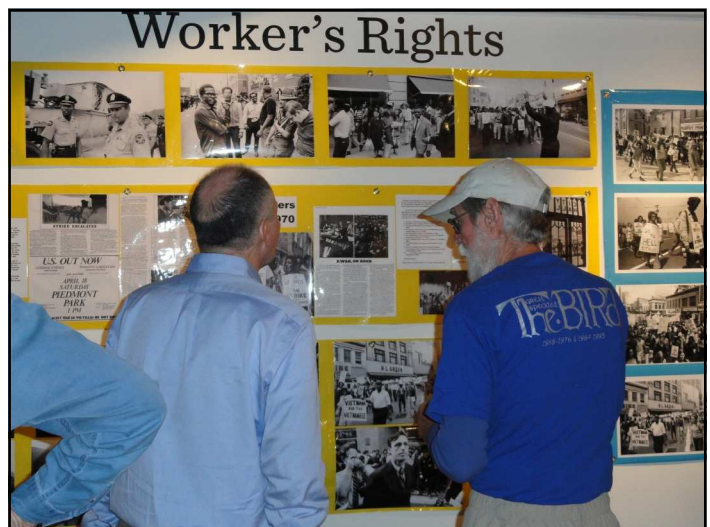
During the opening reception, about 150 visitors enjoyed re-living history and visiting with friends.

1984-85 - Several old Bird writers united with a new group of mostly black activists and intellectuals to attempt a resurrection of The Bird as a progressive voice in the middle of the Reagan Administration. The re-born paper featured commentary opposing Reagan's wars in Central America. It examined bitter battles over dilapidated housing with the Atlanta Housing Authority. It reported community efforts to stop, and then alter the piggyback rail yard built alongside the old Fulton Cotton Mill. But this resurgence was not to last; the paper folded in January 1985. ✦