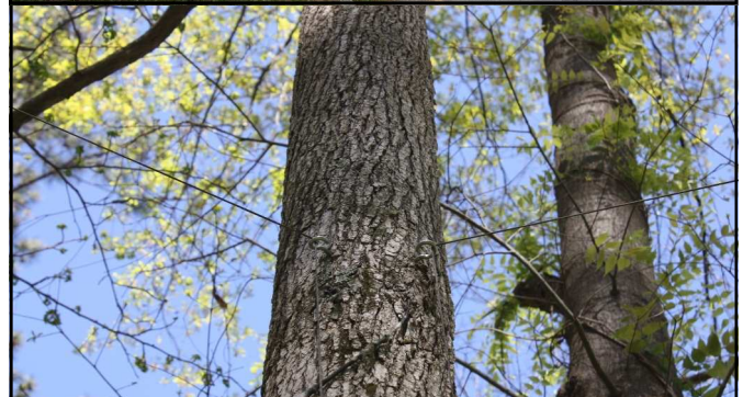
From top: Map showing location of local eruv; Eruv string attached to utility pole in Dunwoody; I-85 sound wall is a boundary; Strings, hooks and a tree in the Emory woods carry the eruv alongside Peachtree Creek.