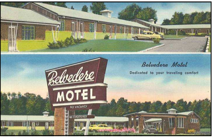
Promotional postcard form the Motel in the 1950s.