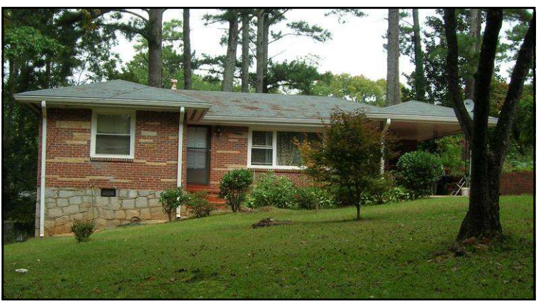
A typical ranch house in DeKalb County, this one is in Belvedere Park.

Northwoods, located in Doraville, was developed as a large planned community for families who sought an alternative to city living. The migration to the suburbs was especially dramatic in DeKalb County, where Scott Candler, the sole Commissioner of Roads and Revenues, encouraged growth and industry. Candler's ambitions can be seen in the rapid industrialization of Doraville, which was also the site of the DeKalb County Water Works, completed in 1942. Candler was able to woo General Motors into locating in Doraville, and over the next decade, the once rural town grew dramatically.