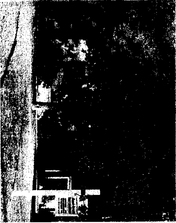
Original Sanctuary Completed In 1941