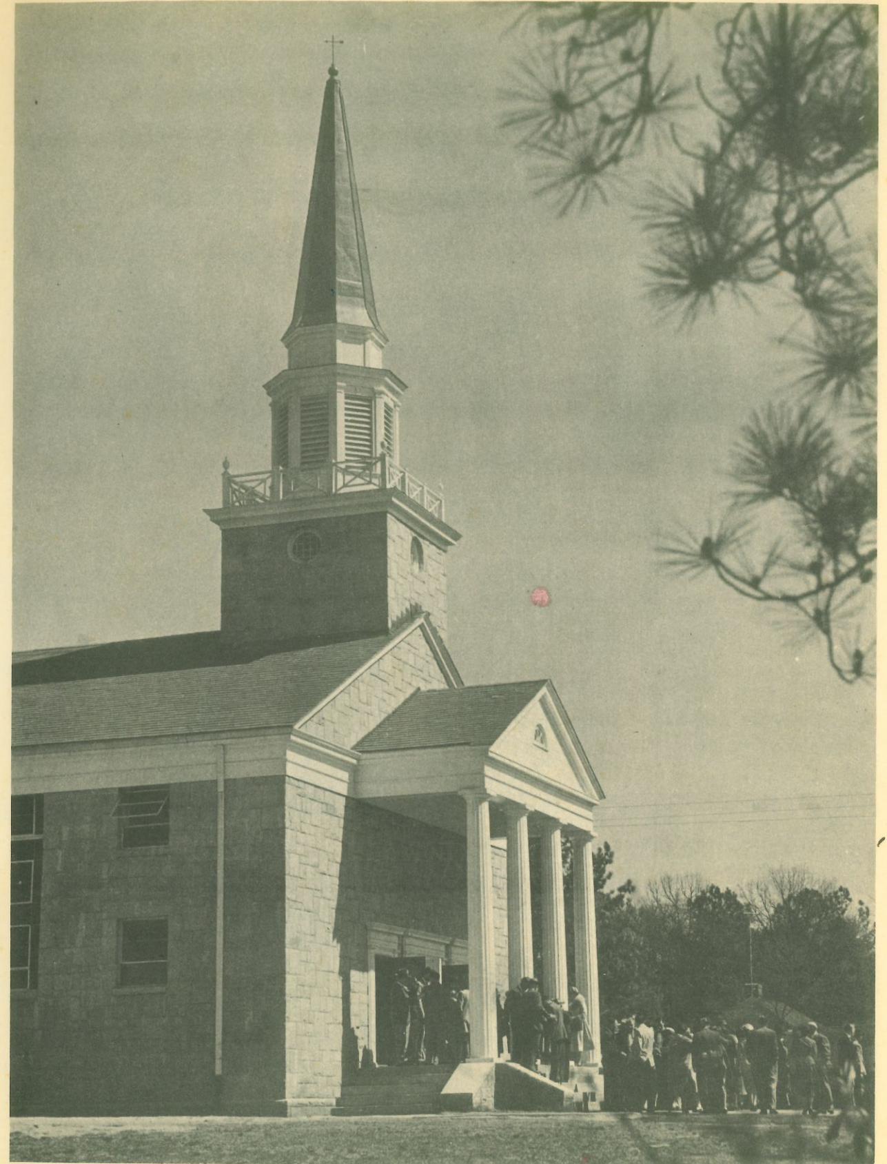
EAST LAKE METHODIST CHURCH

2500 BOULEVARD DRIVE, N.E., ATLANTA 17, GEORGIA