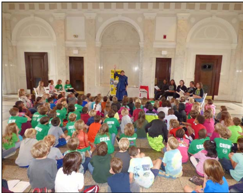
Susan B. Anthony converses with students during the Third Grade History Day program last fall. To learn about upcoming programs please see the accompanying article or check our website.

On March 2, the DHC will present a two-person play, Struggle for Freedom: The Life of Dr. Martin Luther King, Jr. This theatrical production, designed for students in grades 2 - 12, celebrates the work and life of Dr. Martin Luther King, Jr., in the context of the American Civil Rights Movement. Featuring songs from the era, this production offers students the opportunity to experience the heroic work of Dr. King and Rosa Parks. Actors portray the March on Washington and many more of the key moments that shaped both the Civil Rights Movement and our country. The cost is $11 per student and there is a discount for Title I schools.