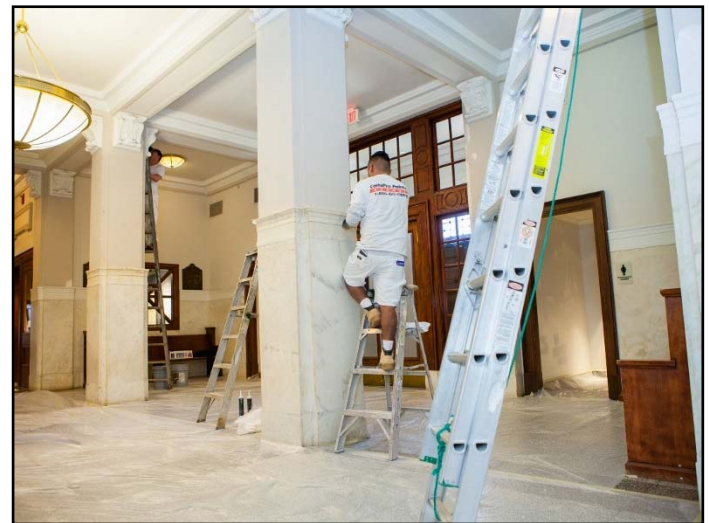
CertaPro team member painting columns in the lobby.