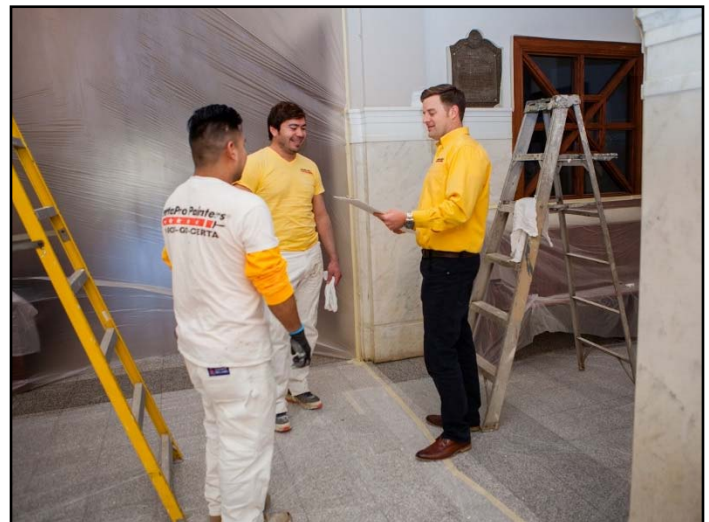
CertaPro crew working in the lobby at the Courthouse.