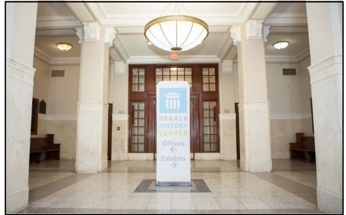
Newly painted lobby of the Historic DeKalb Courthouse.